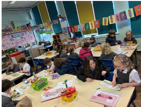
P2 HAVING FUN AT BREAK TIME...