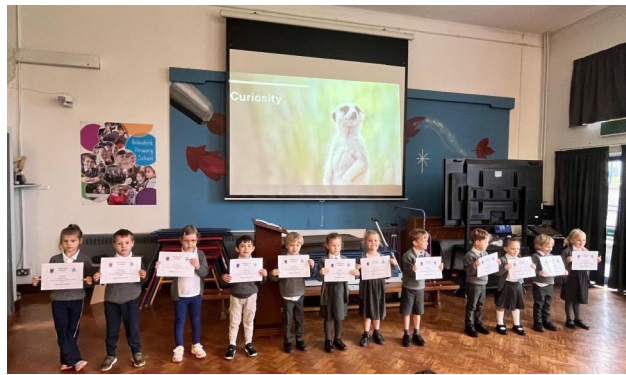
1 - P1-3 Curiosity certificate winners

We also explored a little bit more about this month's value of EMPATHY.