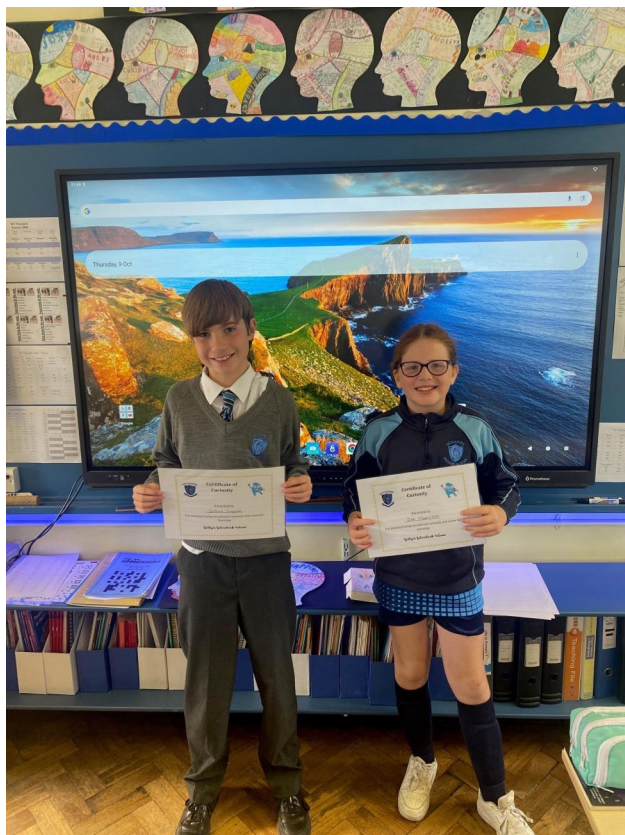
4 - P7H Curiosity winners